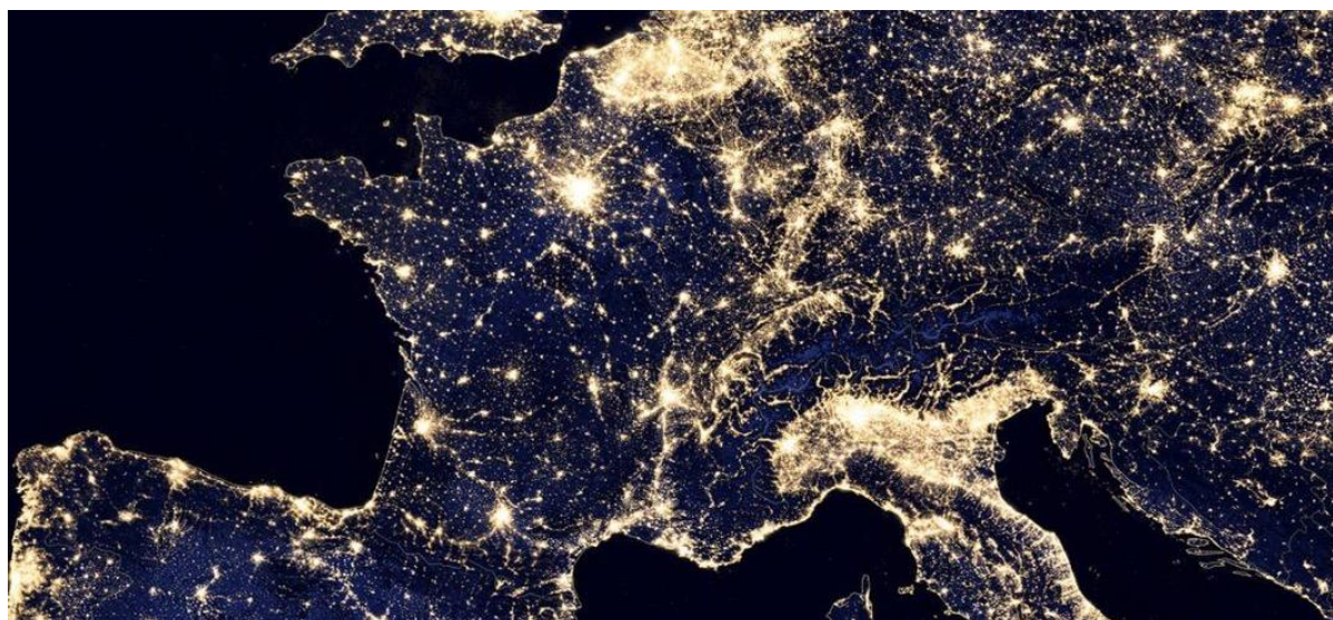
Figure 3. Nighttime light measured from space is an example of an environmental variable to be included in Phase 2 of the Mapineq Link geospatial database.

Note: Nighttime lights viewed from the space-based Earth observation platform of NASA's Defense Meteorological Space Program.